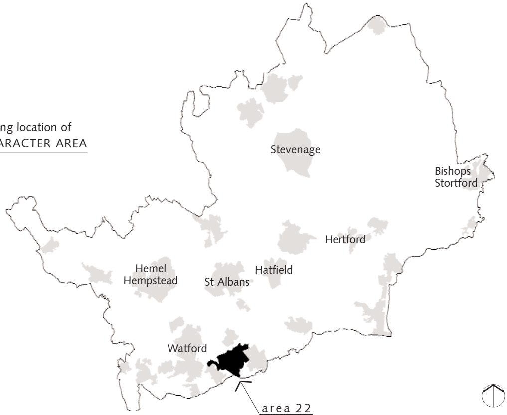
County map showing location of LANDSCAPE CHARACTER AREA