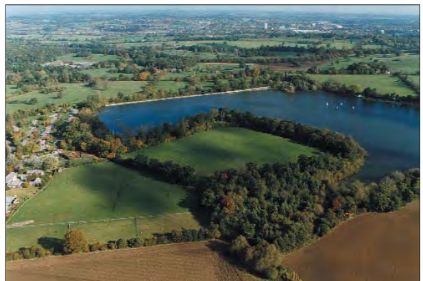
Aldenham Country Park • (Environmental Land Management Service (Rural Estates) HCC)