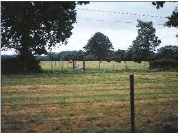
• Cattle at Kendal Hall Farm