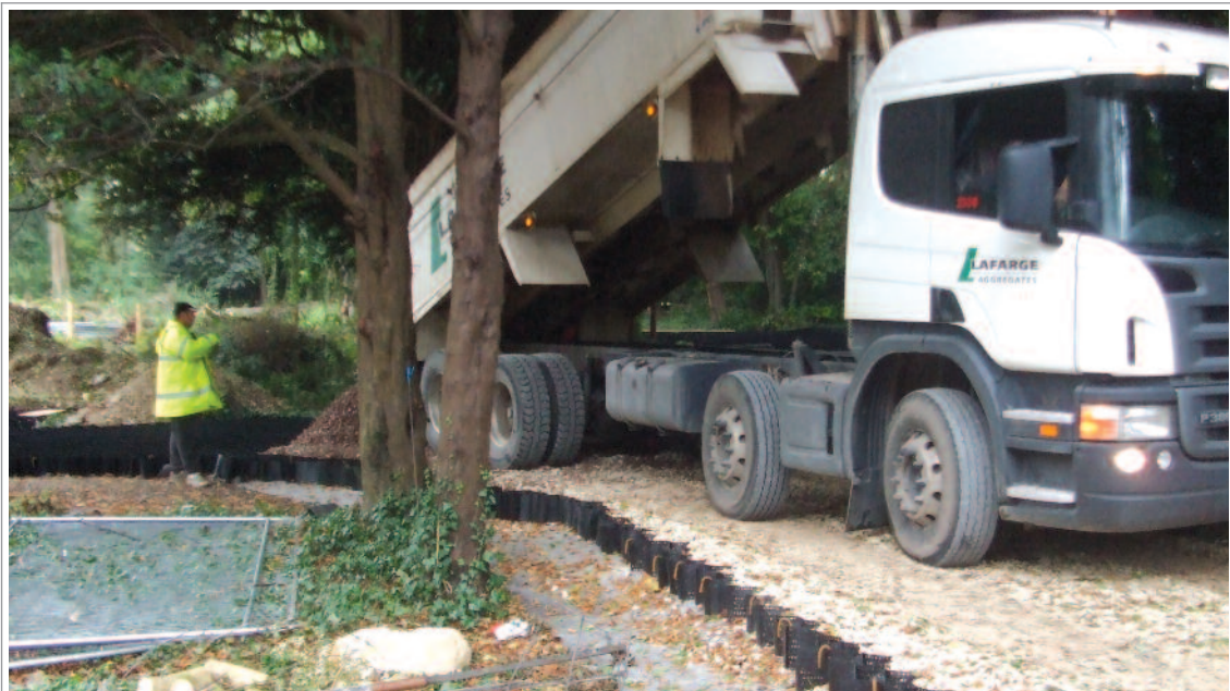
Installing a special surface to allow for heavy plant access through sensitive woodland during construction.