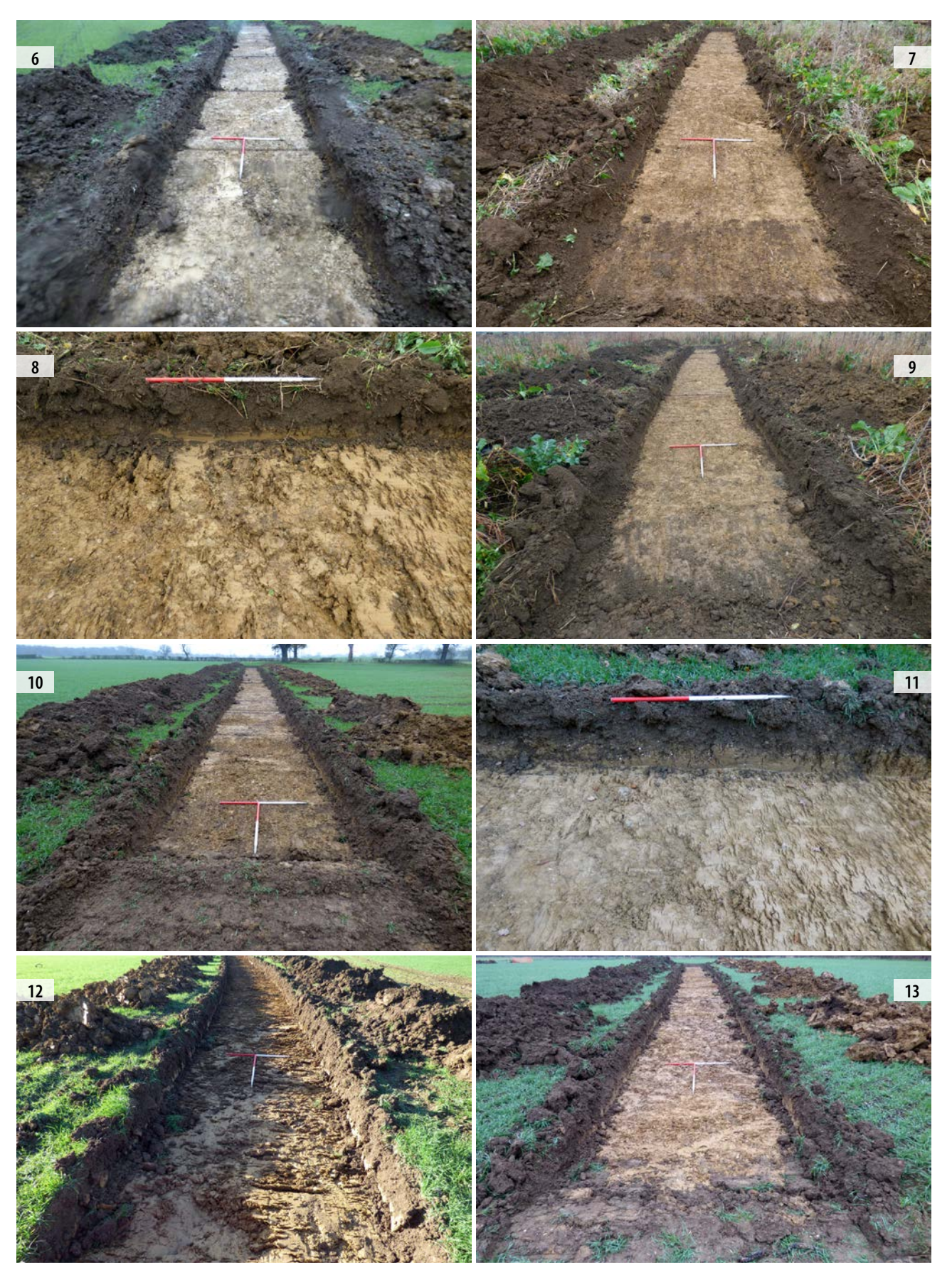
ILLUS 6 General shot of Trench 5ILLUS 7 General shot of Trench 6ILLUS 8 Section in Trench 7ILLUS 9 General shot of Trench 10ILLUS 10 General shot ofTrench 11ILLUS 11 Section in Trench 14ILLUS 12 General shot of Trench 15ILLUS 13 General shot of Trench 20