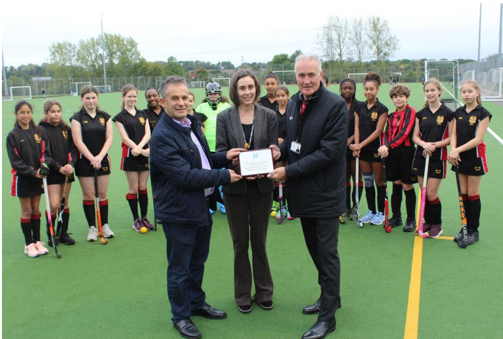
Figure 2: New AstroTurf facility at Dame Alice Owen's School (PB9)