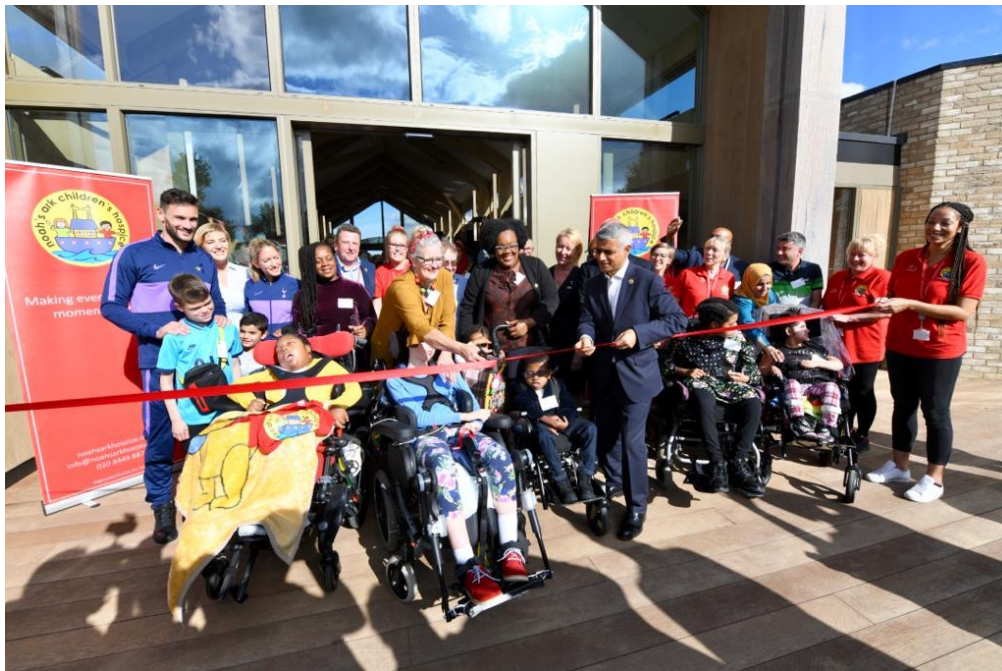
Figure 6: Opening day of Noah's Ark Children Hospice (OB1)